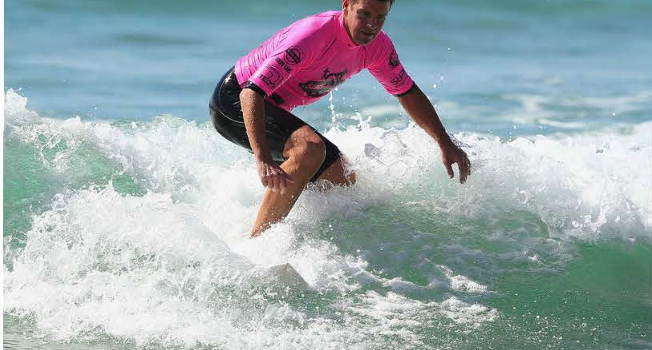
Premier of NSW, Mike Baird catching waves.

After moving to Australia you'll probably want some friends but speaking from experience, Swift said don't come to Australia and expect to make true blue Aussie friends straight off the bat.